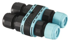
3/4 way terminal block 4 poles IP68 H2O stop. ( \varnothing 5,5 \div 12 mm cable) F990C010000