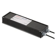
Power supply 24Vdc 100W / 120-240V IP67 Class II selv. Non Dimmable RF25756