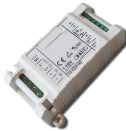
1-10V PWM control interface 24Vdc 120W IP20. Power supply not included F990B14A000