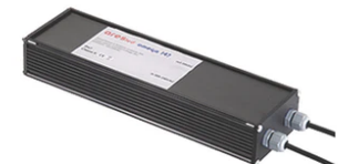
Power supply 24Vdc 50W / 120-240V IP67 Class II selv. Non Dimmable RF25755