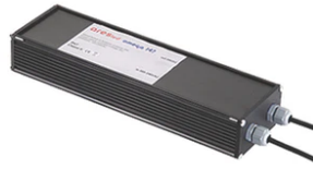
Power supply 24Vdc 50W / 120-240V IP67 Class II selv. Non Dimmable RF25755