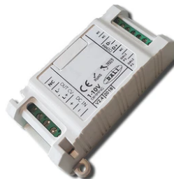
1-10V PWM control interface 24Vdc 120W IP20. Power supply not included F990B14A000