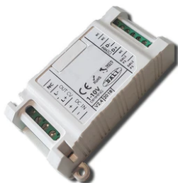
1-10V PWM control interface 24Vdc 120W IP20. Power supply not included F990B14A000