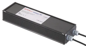
Power supply 24Vdc 50W / 120-240V IP67 Class II selv. Non Dimmable RF25755