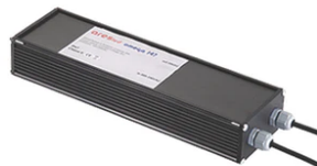
Power supply 24Vdc 50W / 120-240V IP67 Class II selv. Non Dimmable RF25755