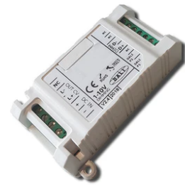
1-10V PWM control interface 24Vdc 120W IP20. Power supply not included F990B14A000