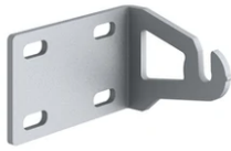
One pair of short brackets L 80 mm. Deep Brown F1203018