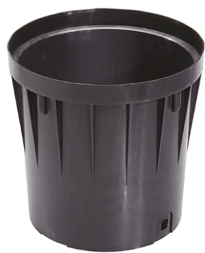
Box for Installation Naboo 290 190