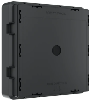
Box for installation F4303000