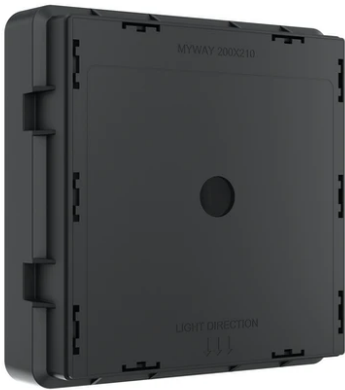
Box for installation F4303000