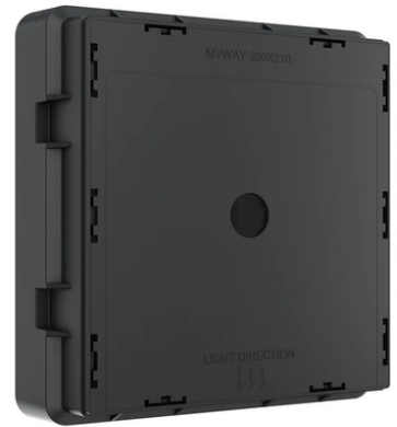
Box for installation F4303000