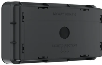
Box for installation F4302000