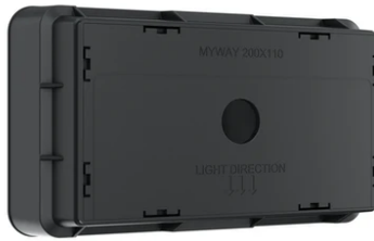
Box for installation F4302000