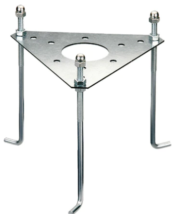
Base Plate and Fixing Bolts Silvia/Mini Silvia pole 21