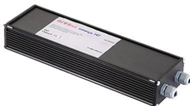
Power Supply Dmx Rgb 36W 220÷230V/3Chx350mA Ip67 141