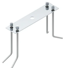
Base plate with bolt F015Z010000