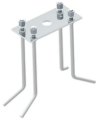
Base plate with bolt F015Z000000