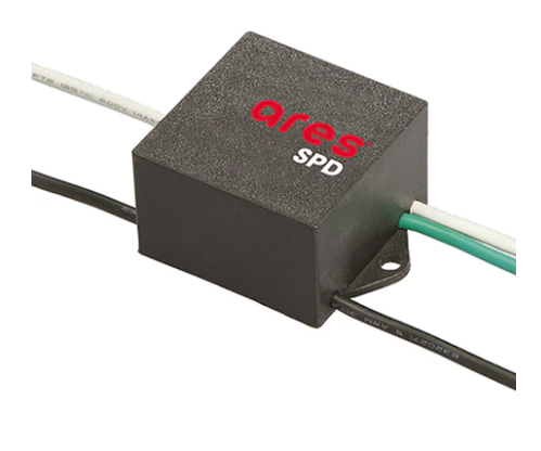
SPD (Surge Protection Device) 237