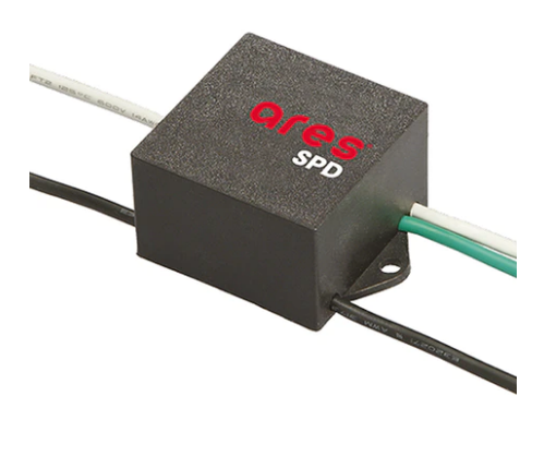
SPD (Surge Protection Device) 237