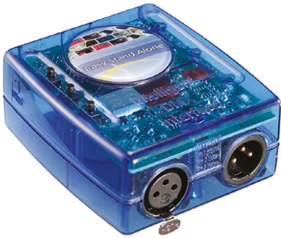
Dmx Controller Stand-Alone/Pc Interface 143