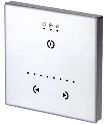
Dmx Controller Dimmer Switch For Recessed Box 142