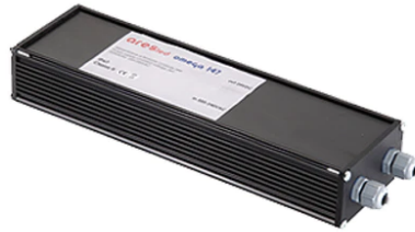
Power Supply Dmx Rgb 36W 220÷230V/3Chx350mA Ip67 141