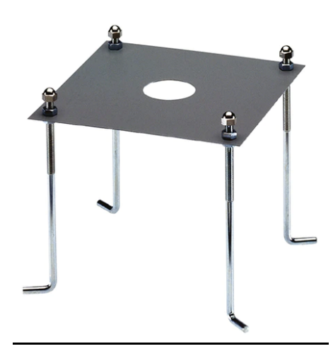
Base Plate and Fixing Bolts for Pole \varnothing 102 mm h 4000/5000 mm with Base 116