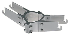
Pole Bracket Franco/Perseo 30 Ø 76 mm 180 mm Double 114.4