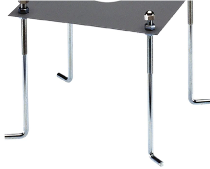
Base Plate and Fixing Bolts for Pole Ø 102 mm h 4000/5000 mm with Base 116