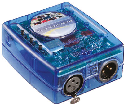
Dmx Controller Stand-Alone/PC Interface 143