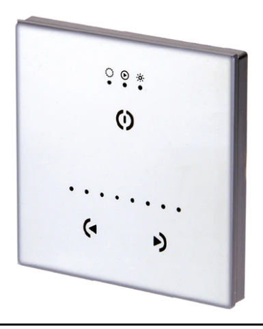
Dmx Controller Dimmer Switch For Recessed Box 142