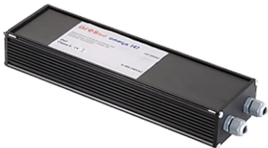
Power Supply Dmx Rgb 36W 220÷230V/3Chx350mA Ip67 141