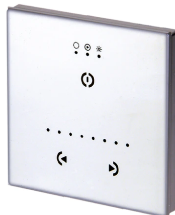
Dmx Controller Dimmer Switch For Recessed Box 142