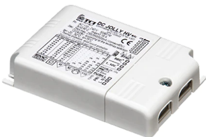
Power Supply 16x1W 110÷240Vac/350 mA Dimmable push-dimm/1-10V Ip20 129