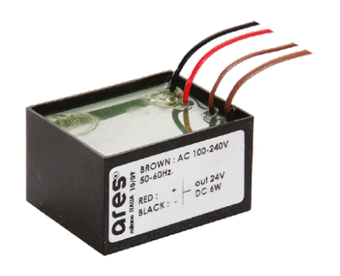
Power Supply 100÷240Vac/ 8W at 24Vdc/ 6W at 350mA lp65 106