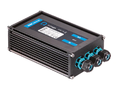
Power Supply Dali 20W 110÷240V/500mA lp67 239