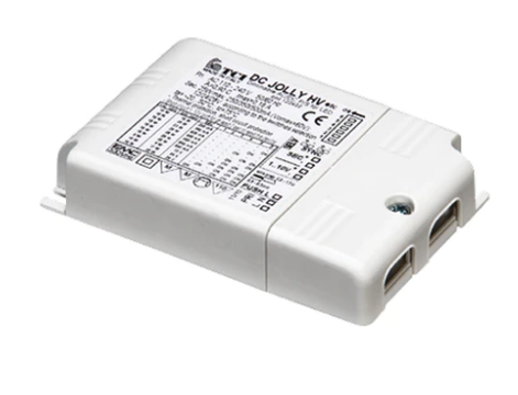
Power Supply 13x2W 110÷240Vac/500 mA Dimmable push-dimm/1-10V lp20 135