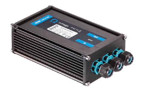
Power Supply 100÷240Vac/8W at 24Vdc/6W at 350mA lp65 106