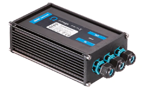
Power Supply 16X1W 110+240V/350mA lp67 184