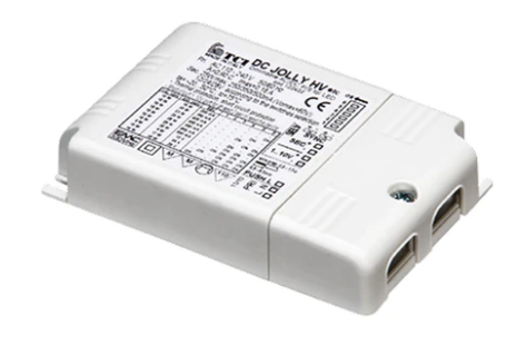
Power Supply 16x1W 110÷240Vac/350 mA Dimmable push-dimm/1-10V Ip20 129