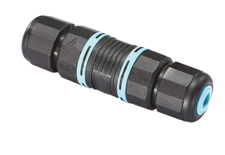
2 Way Terminal Block 4 Poles Ip68 H2O Stop 236