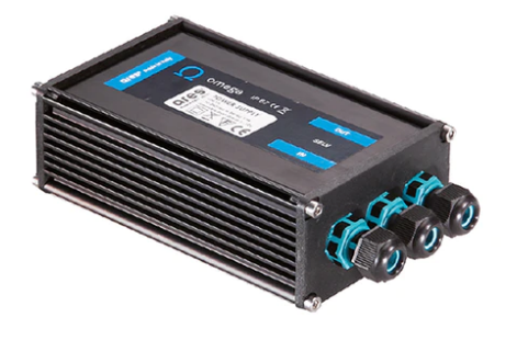
Power Supply 13X2W 110÷240V/500mA lp67 218