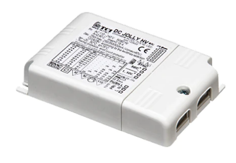
Power Supply 13x2W 110÷240Vac/500 mA Dimmable push-dimm/1-10V Ip20 135