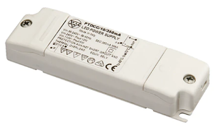
Power Supply 10W 100÷265Vac/350 mA lp40 68