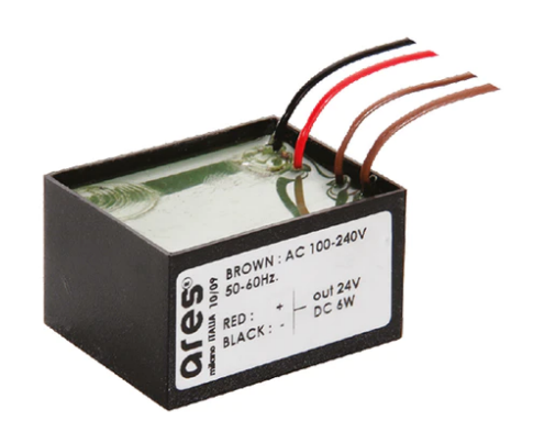
Power Supply 100÷240Vac/ 8W at 24Vdc/ 6W at 350mA lp65 106