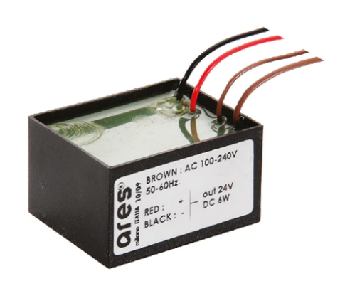
Power Supply 100÷240Vac/ 8W at 24Vdc/ 6W at 350mA lp65 106