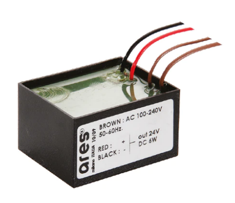
Power Supply 100÷240Vac/ 8W at 24Vdc/ 6W at 350mA lp65 106