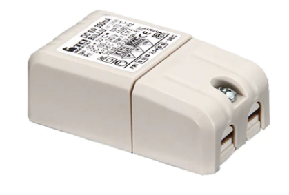
Power Supply 8W 100÷240Vac/24Vdc 350mA lp20 150