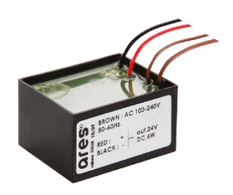
Power Supply 100÷240Vac/ 8W at 24Vdc/ 6W at 350mA lp65 106