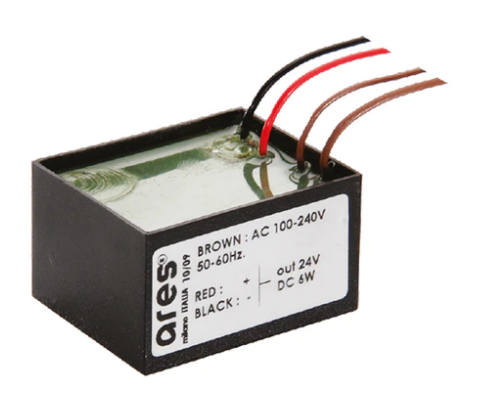
Power Supply 100÷240Vac/ 8W at 24Vdc/ 6W at 350mA lp65 106