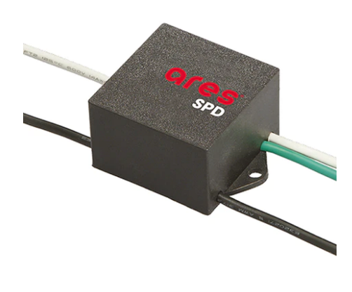
SPD (Surge Protection Device) 237