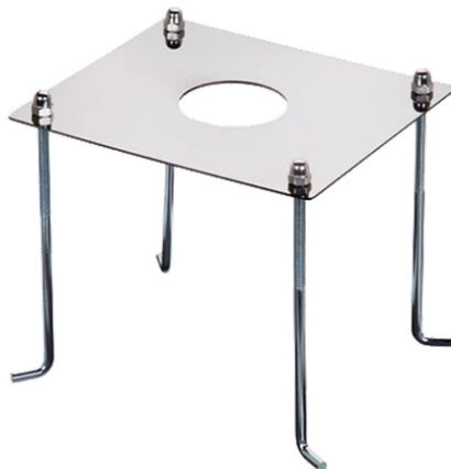
Base Plate and Fixing Bolts Leo 160 pole 131