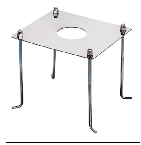
Base Plate and Fixing Bolts Leo 160 pole 131