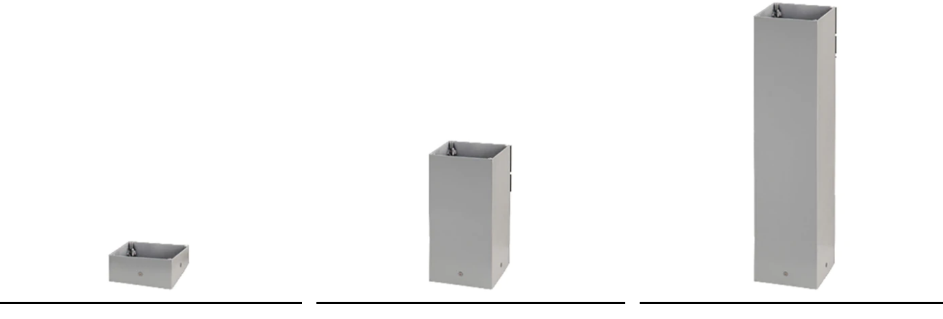
Pole Leo 160 h 70 mm 12425.1