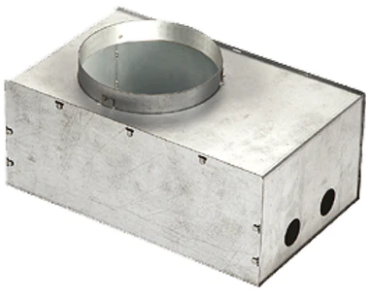
Box for Ceiling Recessed Installation Leila 165 198