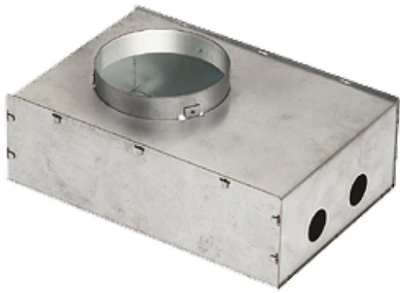
Box for Ceiling Recessed Installation Leila 135 197