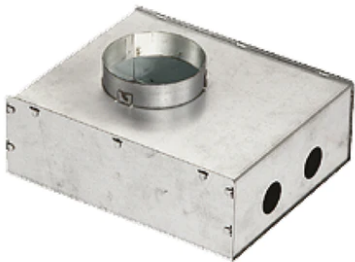
Box for Ceiling Recessed Installation Leila 105 196