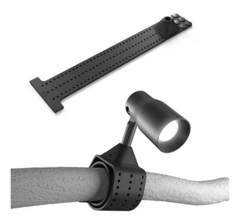
Earth stick F004Z060000