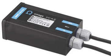
Power supply 24V 10W / 110-240V IP67 Class II selv._Non Dimmable RF25757