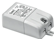
Power supply 24V 8W / 110-240V IP20 Class II selv._Non Dimmable RF25754