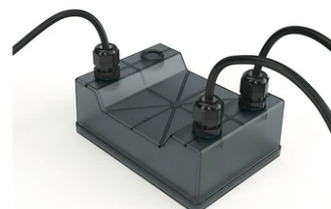
Power supply 120/270Vac / 24Vdc.70W Dimmable DALI PWM control. IP67 F990B05A000