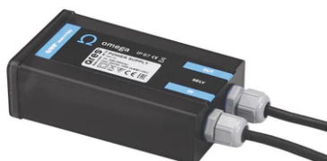
Power supply 24V 10W / 110-240V IP67 Class II selv._Non Dimmable RF25757