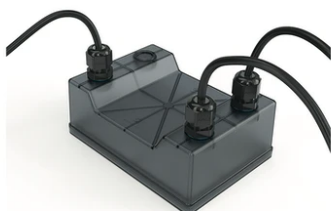
1-10V PWM control interface 24Vdc 120W. IP67. Power supply not included. F990B00A000