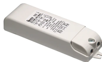
Power supply 24V 10W / 110-240V IP20 Class II selv. Non Dimmable RF25747